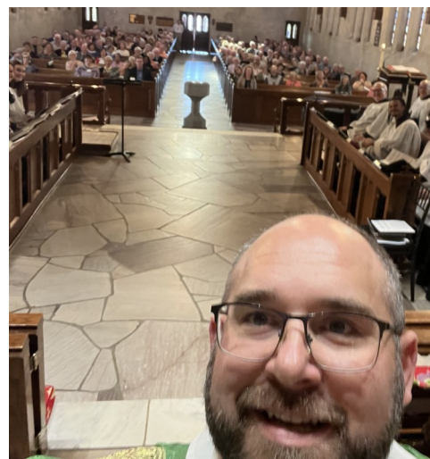
Pictured above: Top - Easter Day Eucharist. Bottom Left - The Lee clan at Happening closing. Bottom Center - Fundraiser for Glory Ridge. Bottom Right - the day after the Bishop’s election.