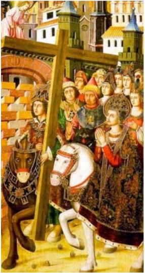
St. Helena & Heraclius taking the Cross to Jerusalem