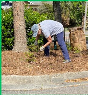
Beautifying the grounds of St. Paul's Episcopal Church