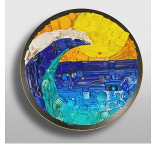
And a close up of those parts:

St Paul's is getting ready for Summer Arts Camp (June 26-30) and looking forward to some exciting projects! We are going to create mosaics from single use/non-recyclable plastics. We're asking everyone we know to please save CLEAN plastic bits that would normally be thrown away: bottle caps, marker caps, small plastic toys, etc. It's a great exercise to help you see how rapidly plastic waste accumulates and it will be put to good use! To give you an idea of the art project and supplies we are looking for, here's an example by Wilmington artist Harvest Ganong: