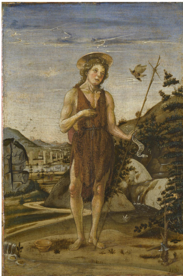
Saint John the Baptist in the Wilderness Biagio d'Antonio da Firenze, 1480s

In the Episcopal Diocese of East Carolina