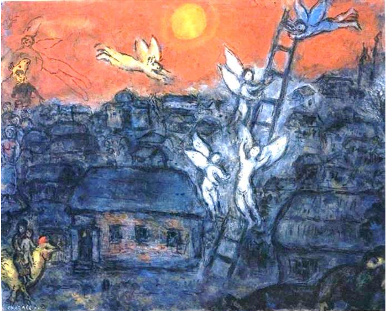
Marc Chagall (Russian/French, 1887-1985) Jacob's Ladder , 1973. Private collection.

In the Episcopal Diocese of East Carolina